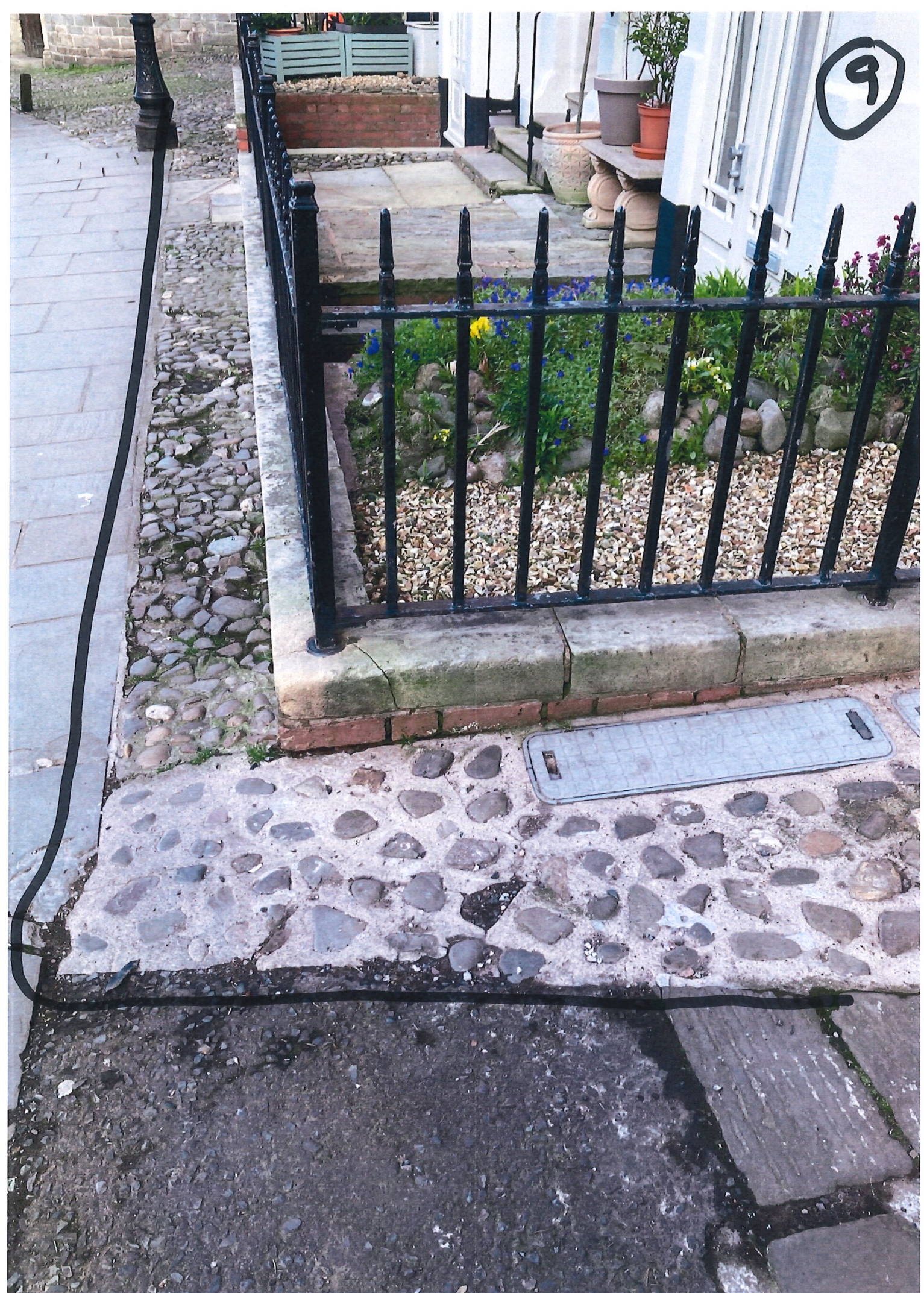
STONES + RAILINGS BELONGING TO 26 CASTLE ST.