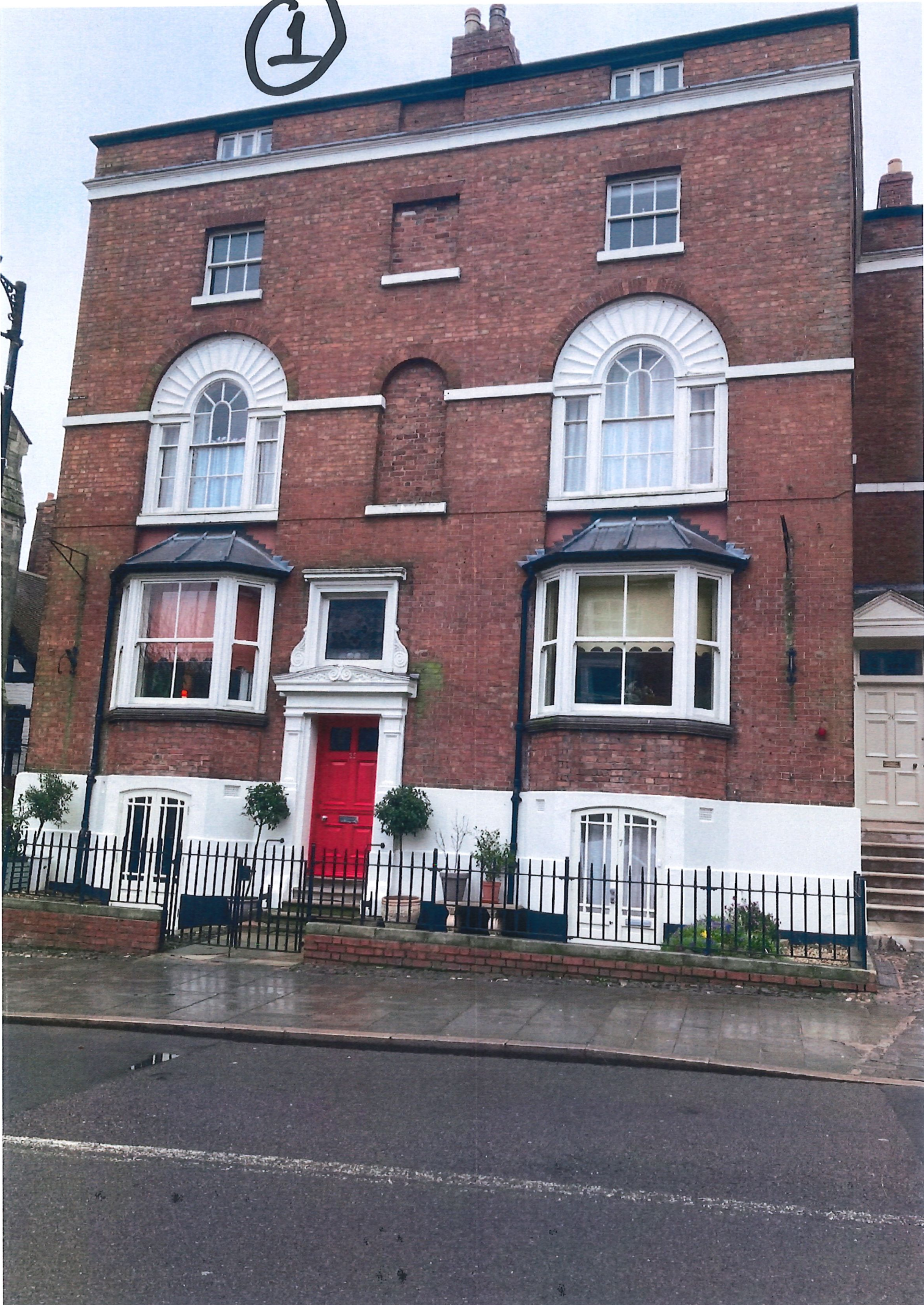
FRONT OF GRADE II RESIDENTIAL BUILDING