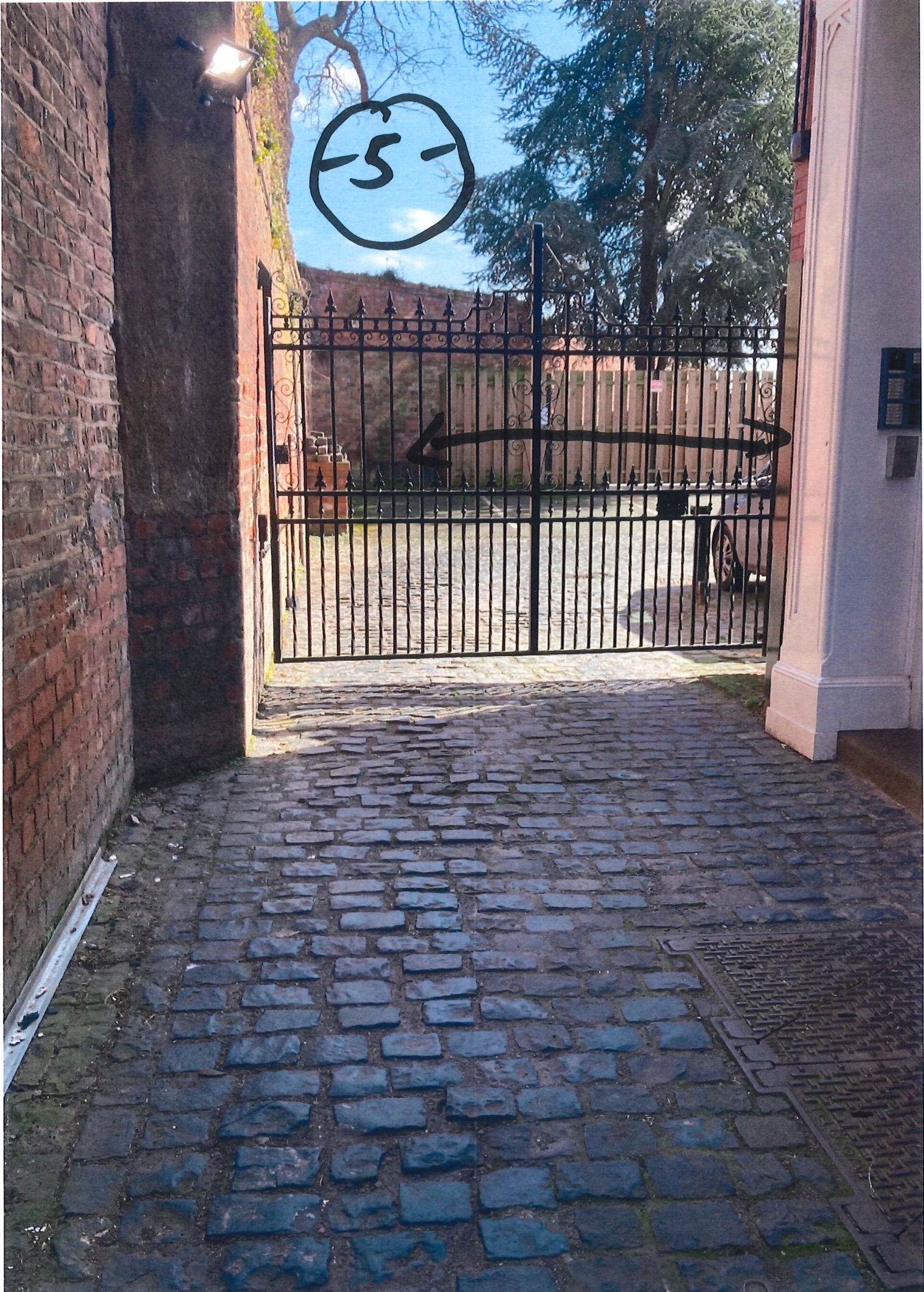
ARROW SHOWING BIN AREA IN CAR PARK