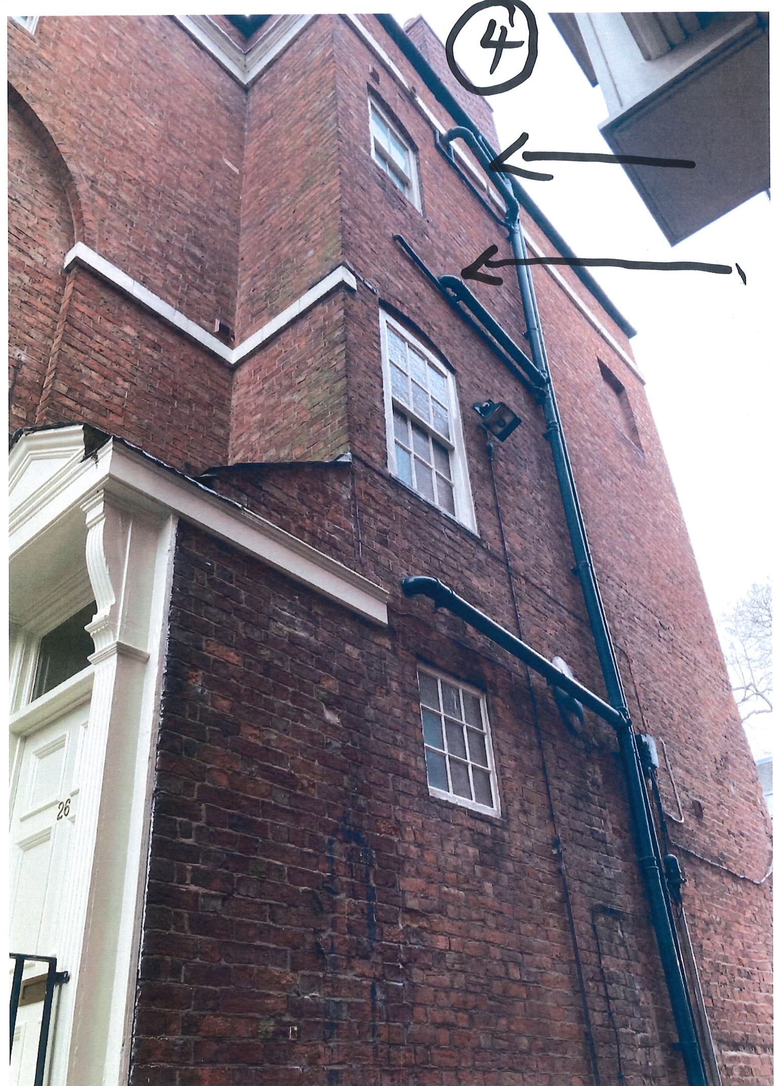
ARROWS SHOWING LIVING ACCOMMODATION AT SIDE ADJACENT TO 28 CASTLE STREET