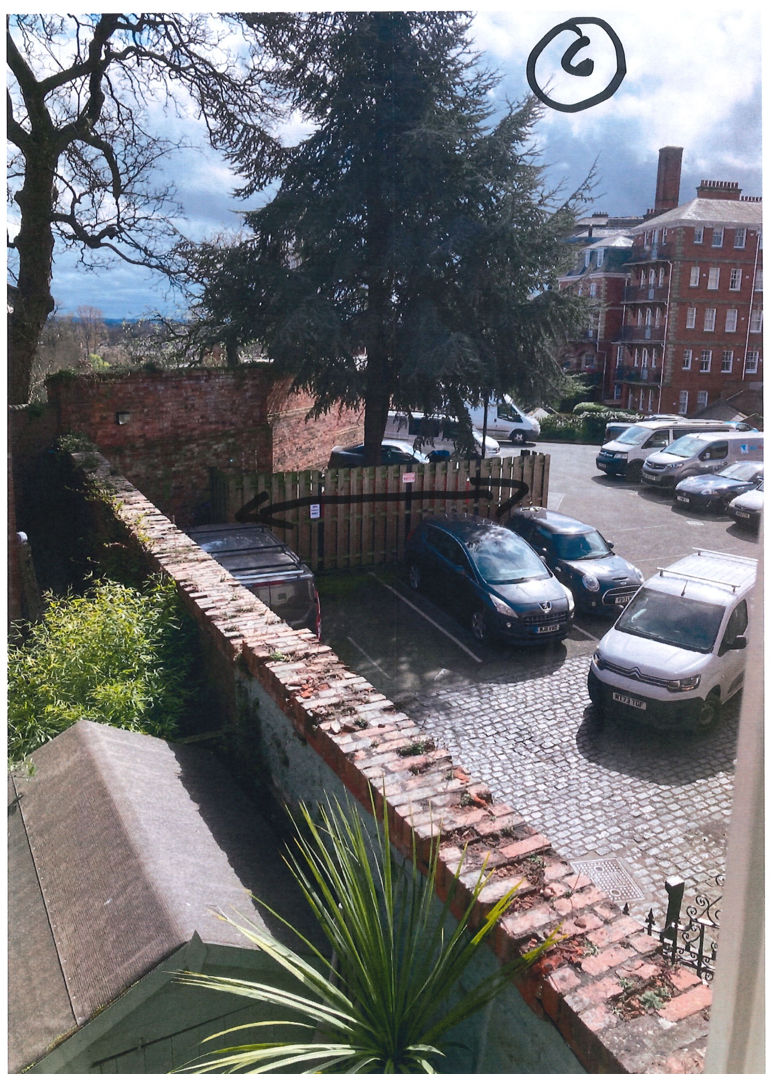
VIEW OF BIN AREA FROM APARTMENT 20 CASTLE ST.